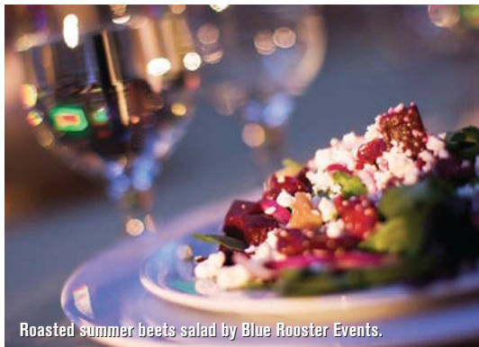
Roasted summer beets salad by Blue Rooster Events.