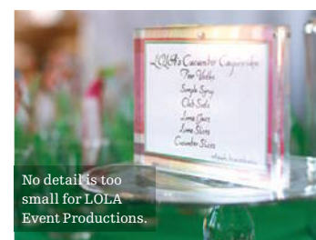
No detail is too small for LOLA Event Productions.

Work individually with I Do's top stationary designer without the design fee and be among the first to view the innovative Primrose collection. Mention CS Brides and receive a complimentary matching response set valued at up to $350. February 21. Appointment requested. At I Do! I Do! Wedding Accessories, 4704 N. Damen Ave., 773.907.8890, ido-ido.weddingstar.com.