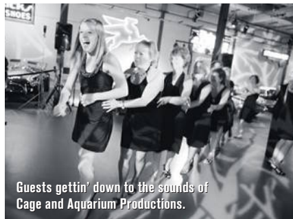
Guests gettin' down to the sounds of Cage and Aquarium Productions.