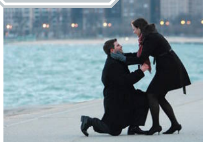
A lakefront proposal.