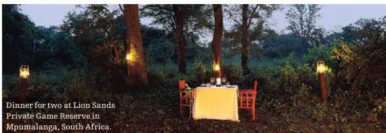
Dinner for two at Lion Sands Private Game Reserve in Mpumalanga, South Africa.

BON VOYAGE! You went out of your way to vet photographers 'til you found the very best one to document your big day. But what about the honeymoon? Shouldn't those special memories be preserved forever, too? Sure, a digital camera can get the job done, but there are other chic options out there. Take, for example, I Do Films' unique Super 8 Honeymoon package. They'll loan you a Super 8mm camera with four 50-foot reels of film and a handy how-to guide in addition to a one-hour training session before you hit the beach. Best of all, the vintage look of the film—think the opening credits for The Wonder Years —"makes everybody look glamorous," says co-owner and artistic director Lori Roche. Then, when you get back, I Do Films will work the footage into a keepsake video you can cherish as long as you both shall live. $800. 847.905.0352, idofilms.net. -V.C.