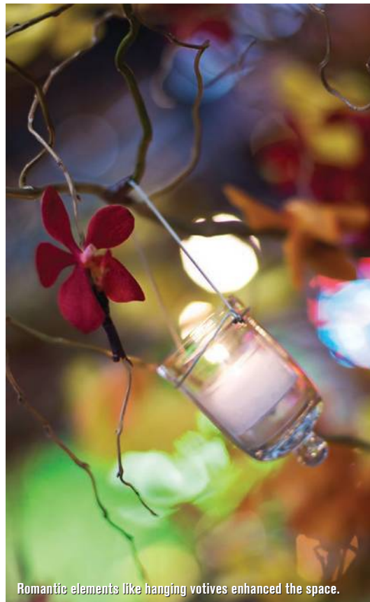
Romantic elements like hanging votives enhanced the space.