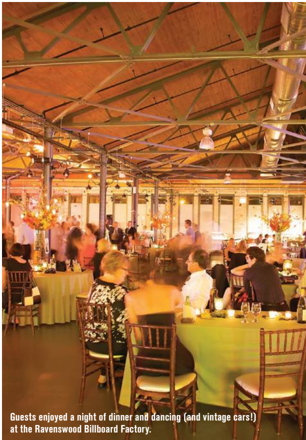
Guests enjoyed a night of dinner and dancing (and vintage cars!) at the Ravenswood Billboard Factory.