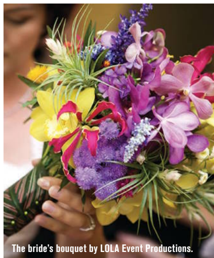
The bride's bouquet by LOLA Event Productions.